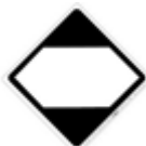
Limited Quantity Ground